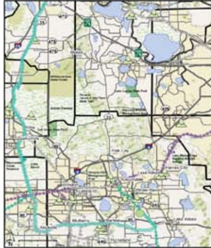
Strategic Habitat Conservation Areas/Recreation Lands