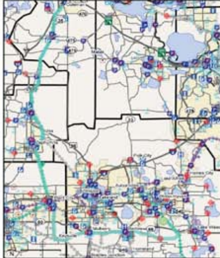
Public Facilities/Historic Resources