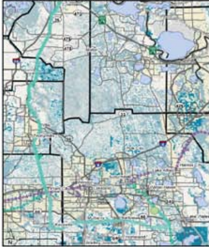
FEMA Floodplain/NWI Wetland Locations