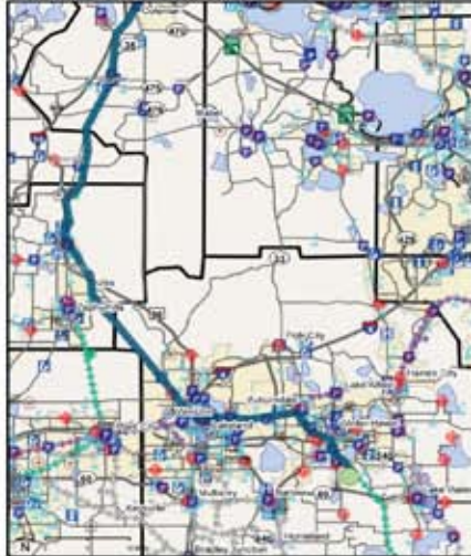
Public Facilities/Historic Resources