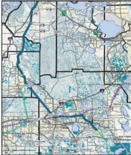
FEMA Floodplain/NWI Wetland Locations