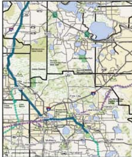
Strategic Habitat Conservation Areas/Recreation Lands